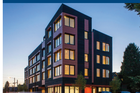
Quebec City, QC